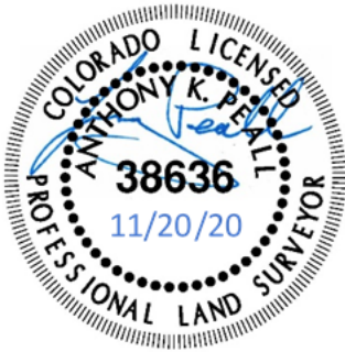
EXHIBIT ATTACHED AND MADE A PART HEREOF.